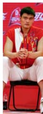
Coca-Cola and Yao Ming were tops in China.

The study also analyzed which athletes attracted the most attention from Chinese