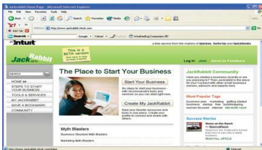
Figure 1 — Positive blogger feedback generated exponential visitor growth for jackrabbit.intuit.com.

Intuit's recent efforts provide as close to a best-practice example of how to measure an amplified word-of-mouth campaign as you'll find. The firm had recently launched its new portal Web site jackrabbit.intuit.com, which provided new small-business owners with actionable content and tools they could find useful in starting and building their businesses. The content came from both Intuit and other industry sources.