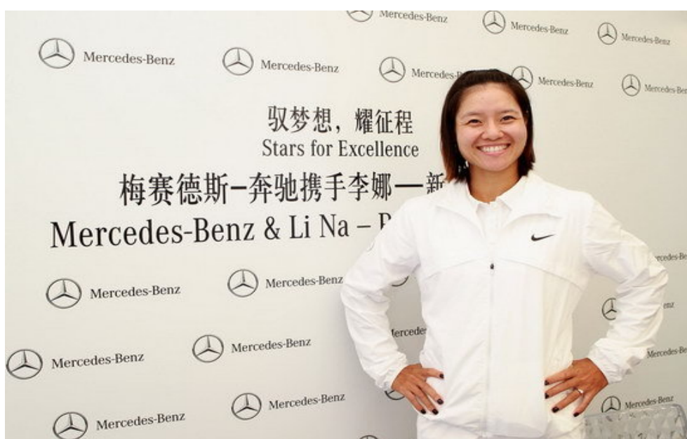
Tennis star Li Na and Mercedes Benz “partner for perfection” June 2011

Professional Tennis player, Li Na has entered the Top 30 Most Engaging Celebrities this quarter. Li Na now endorses a number of Big Name brands in China, including most recently Mercedes Benz, for whom she is the first Chinese global spokesperson.