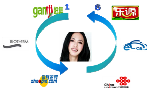
Top 6 brand linkage with Yao Chen